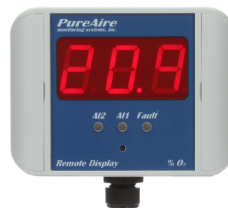
Remote Digital Display