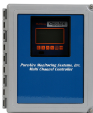
8 Channel Programmable Controller for O2 or Gas Monitors