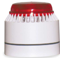
Red Horn/Strobe 24VDC